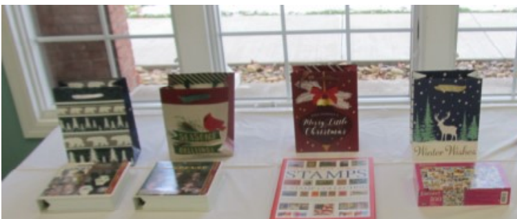
Chinese Auction Items