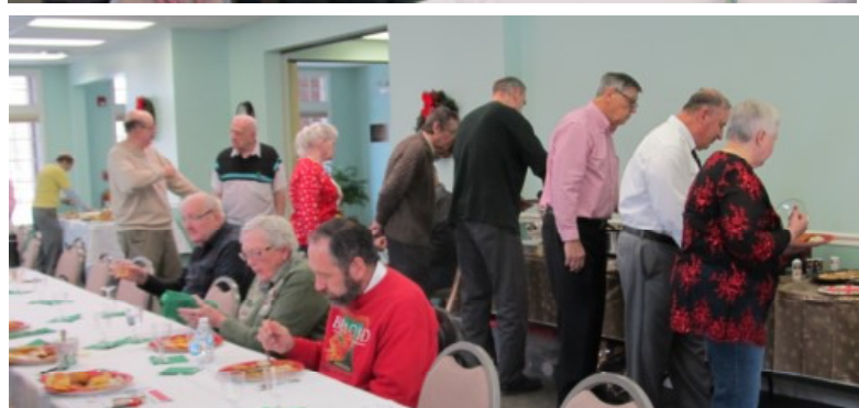
Food and Fellowship enjoyed by all...