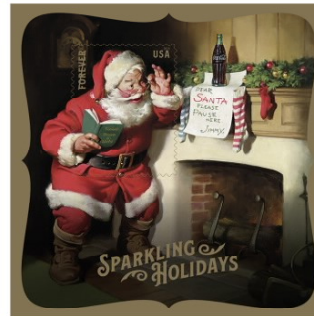
2018 Sparkling Holidays Souvenir Sheet – forever stamp

instance in excellent condition the US White Plains sheet of 1926 is worth hundreds of dollars), modern ones are typically produced in considerable quantities and have no special value. Modified From Wikipedia,