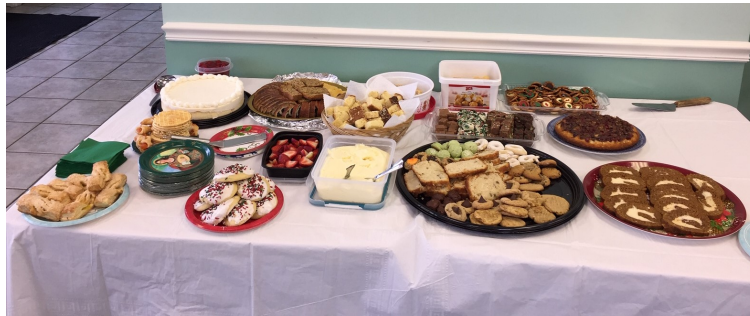
Luscious Dessert Table